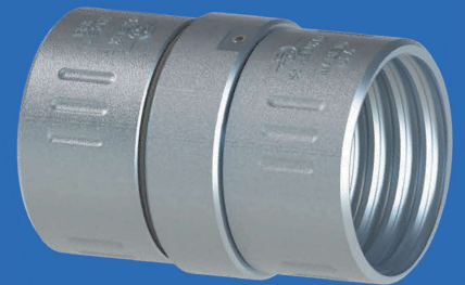
SWIVEL FITTING (HMSV)