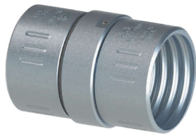
SWIVEL FITTING (HMSV)